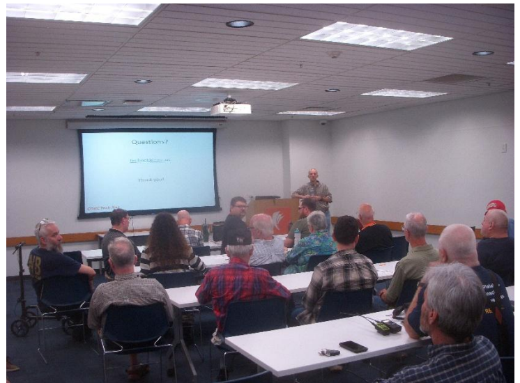
Picture from the in-person Tech Net held last Month.